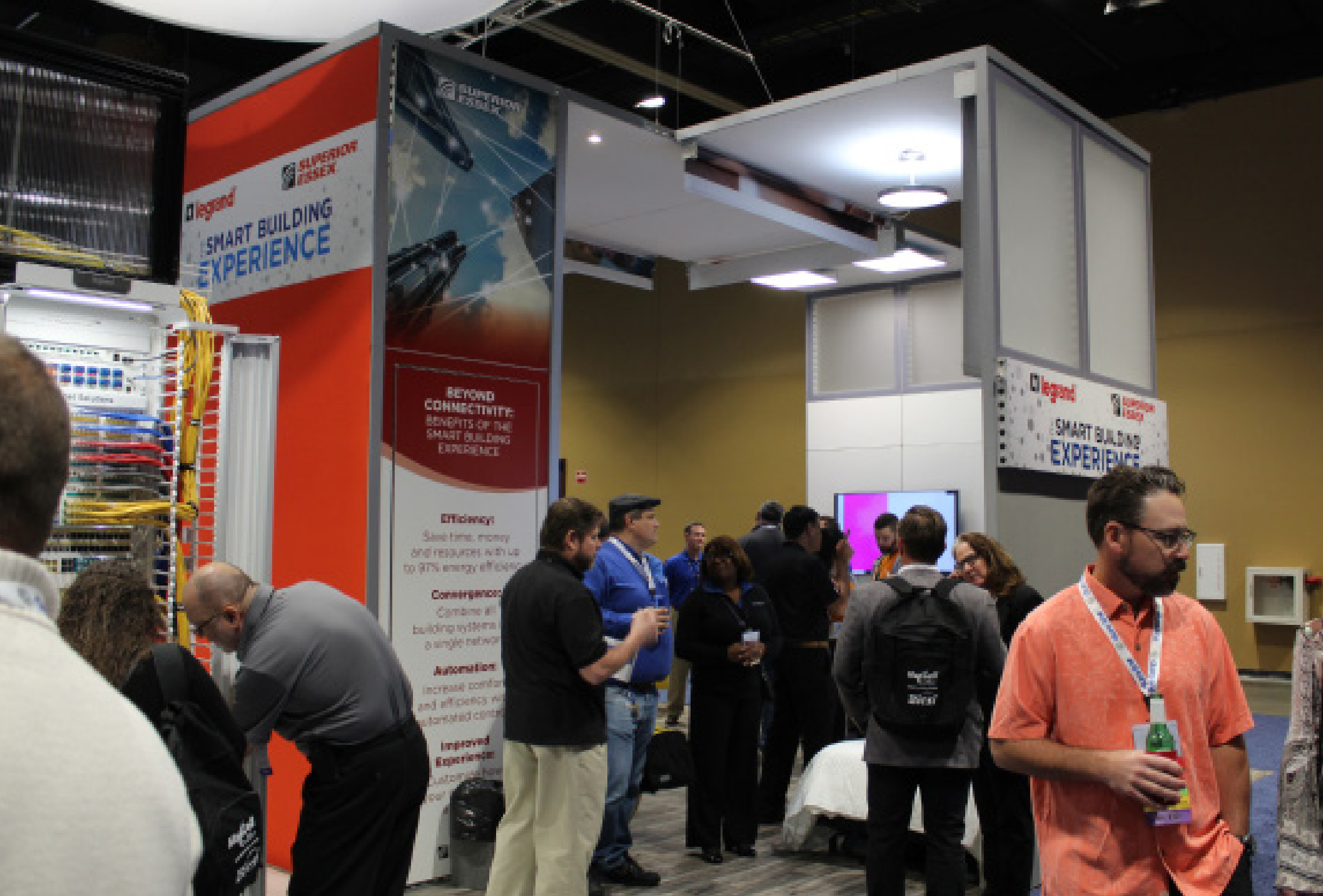
BICSI Winter 2019 Orlando, Florida | January 2019