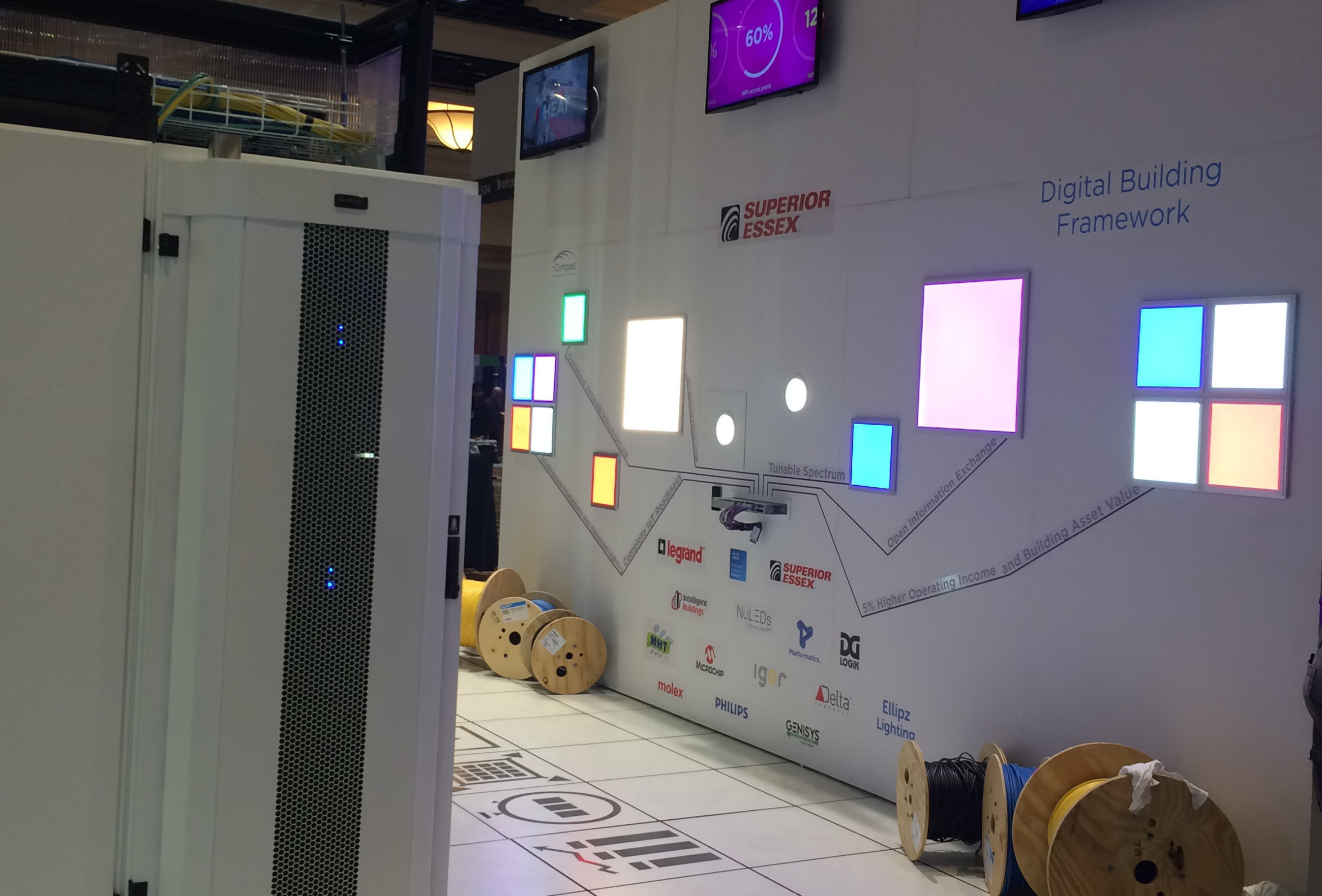
BICSI Fall 2017 September 2017