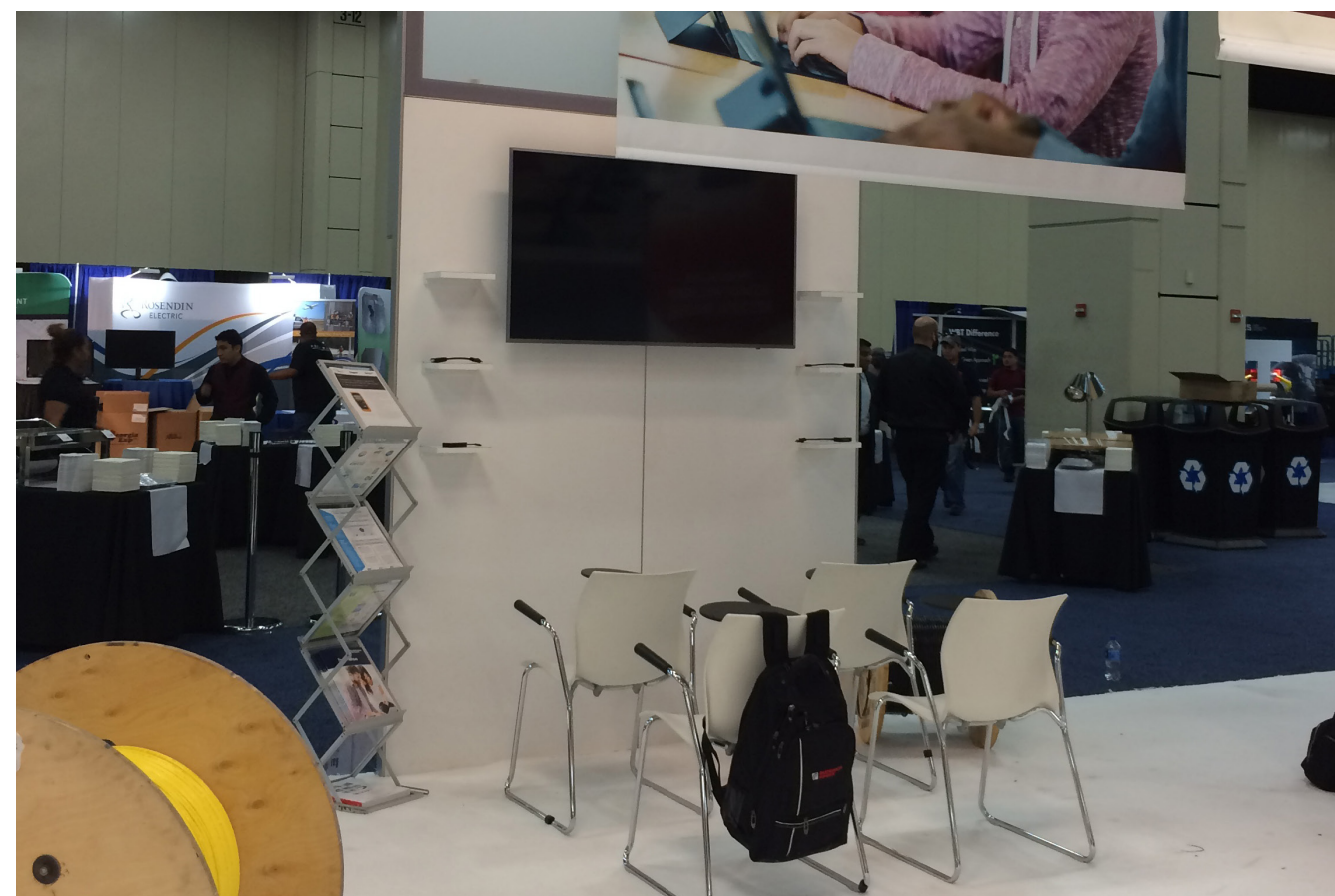
BICSI Fall 2018 San Antonio, Texas | September 2018