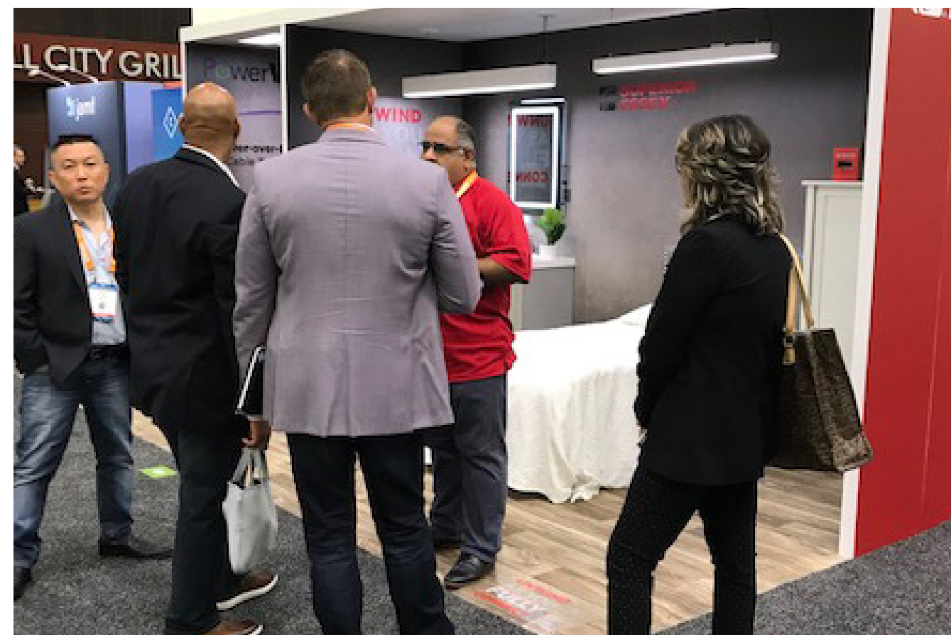
HiTec 2019 Minneapolis, Minnesota | June 2019