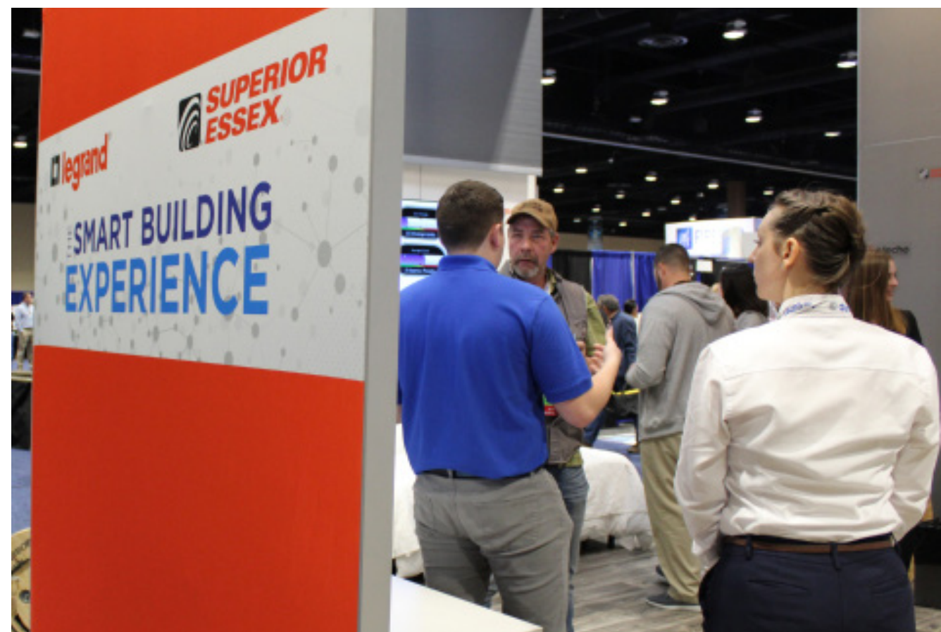
BICSI Winter 2019 Orlando, Florida | January 2019