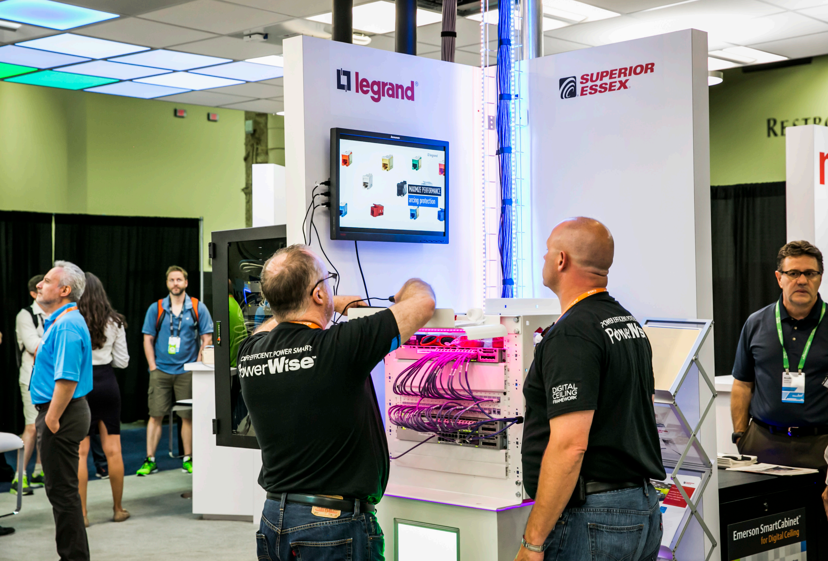
Cisco Live 2016 July 2016