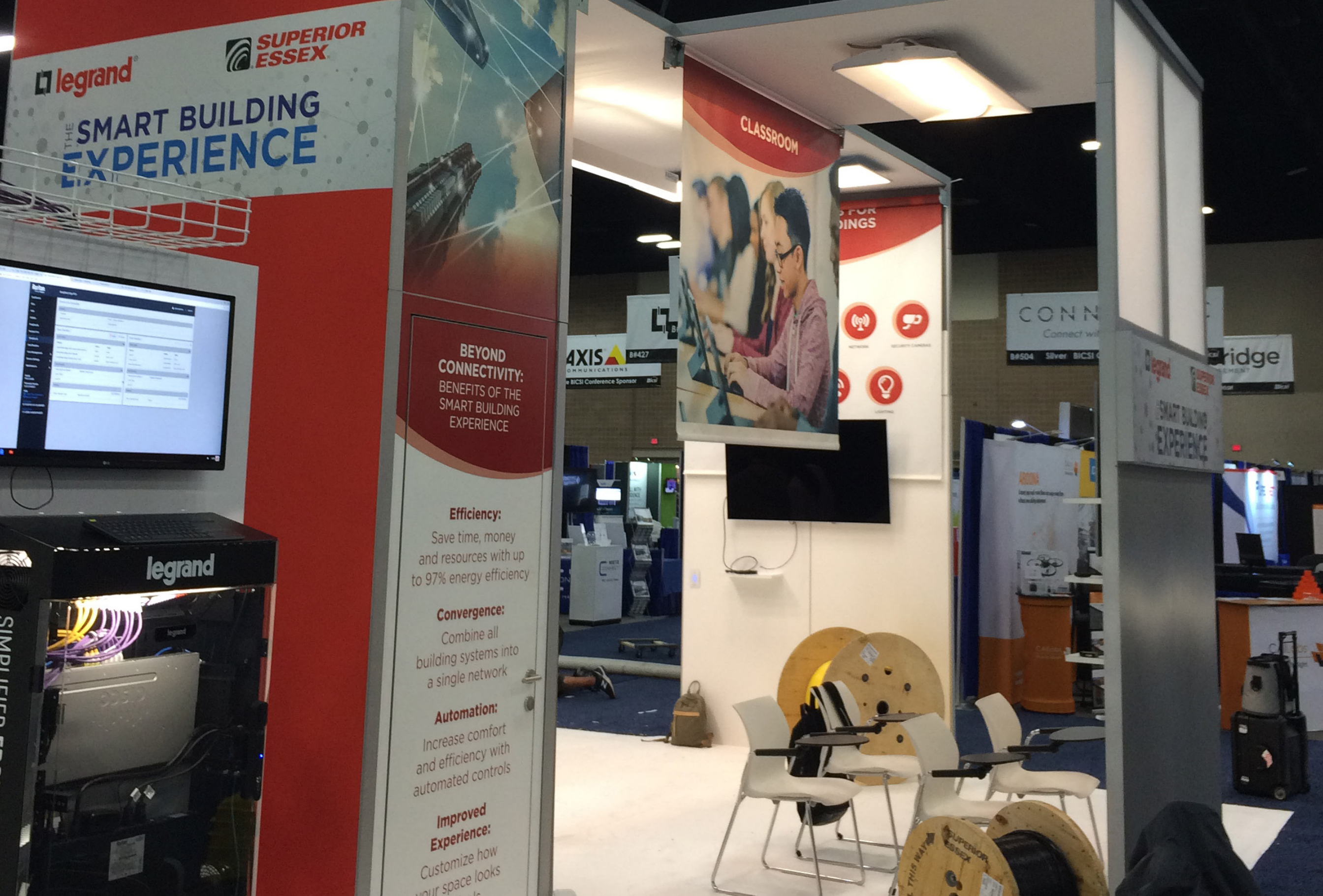
BICSI Fall 2018 San Antonio, Texas | September 2018