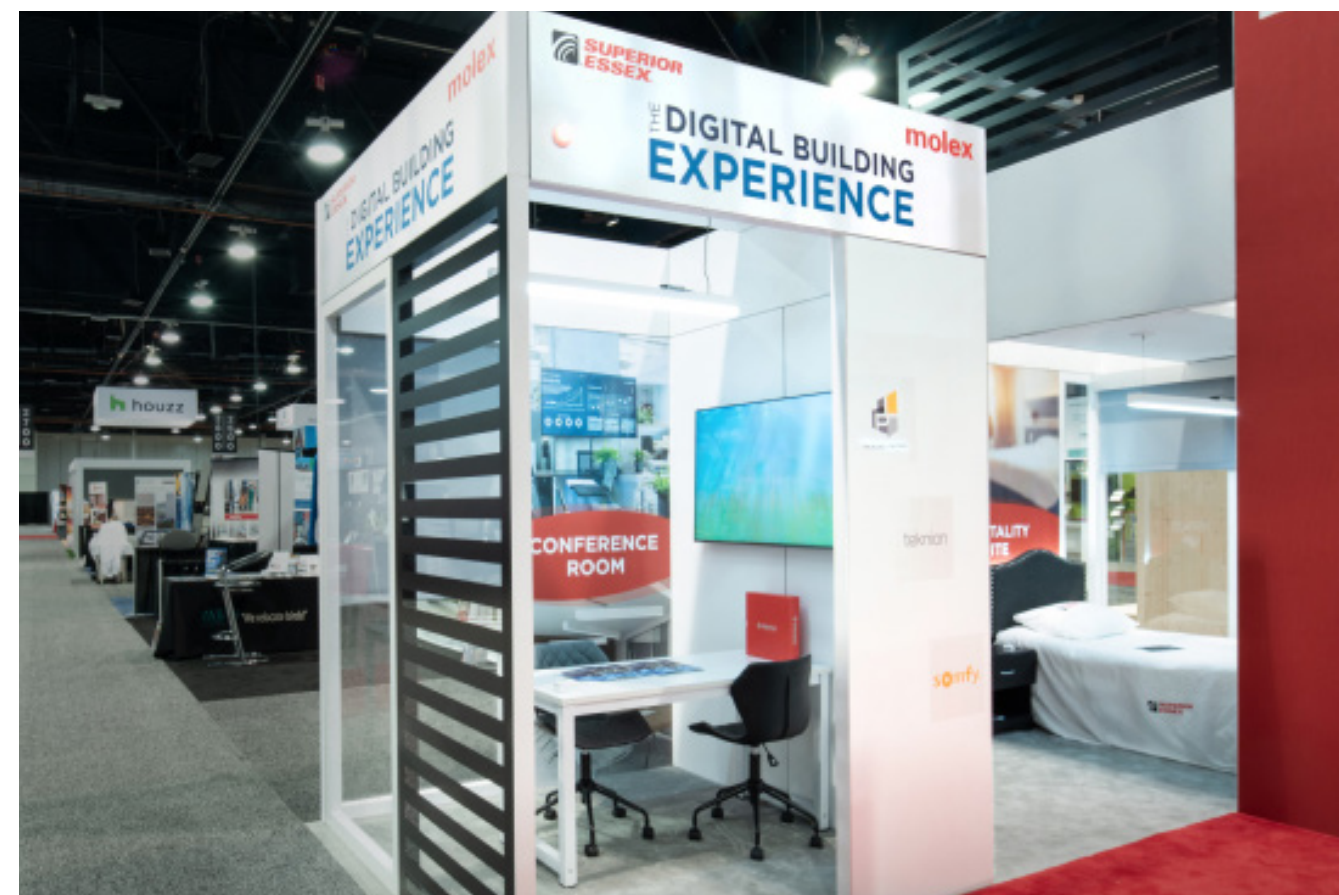
AIA 2019 Las Vegas, Nevada | June 2019