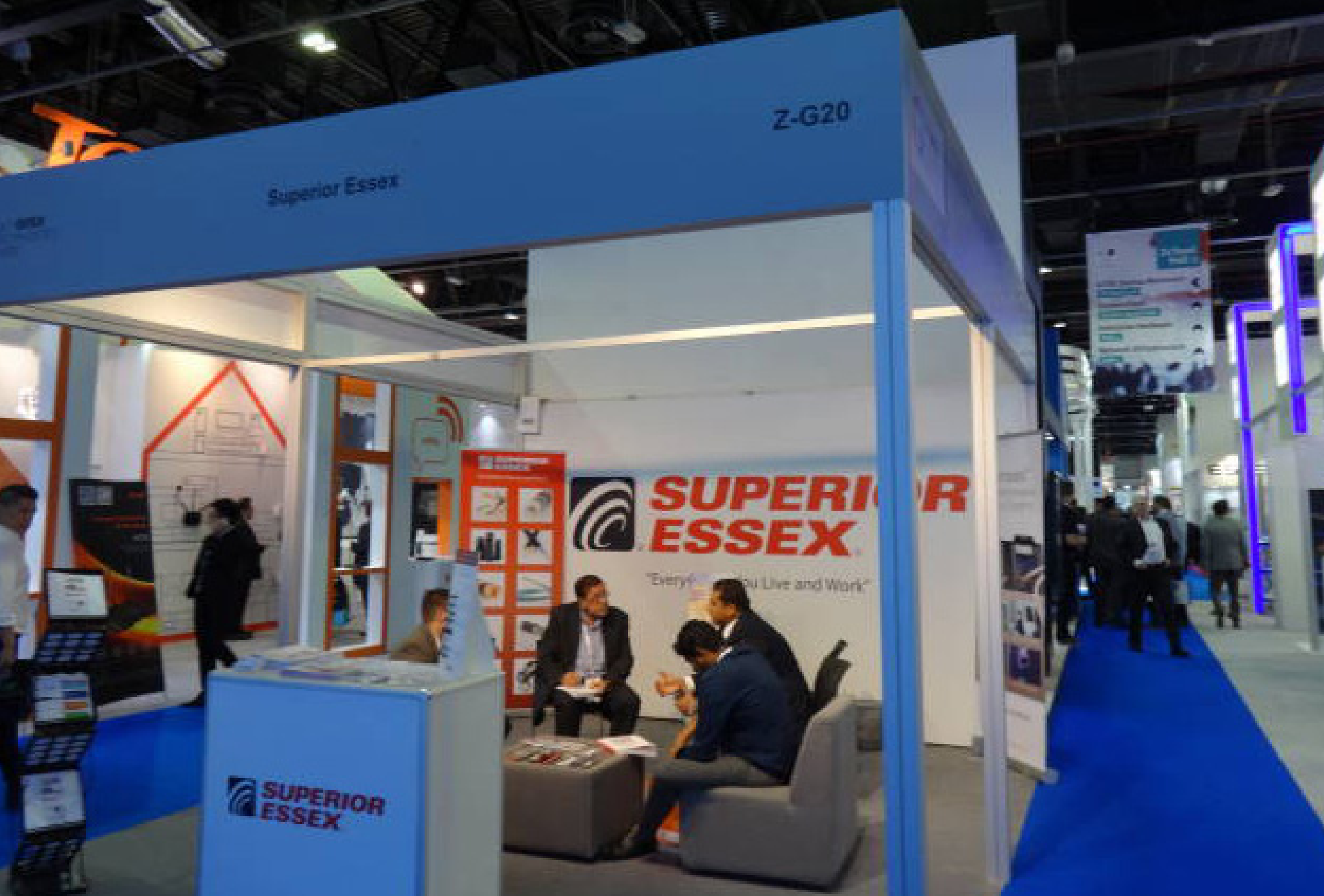
GITEX 2016 October 2016