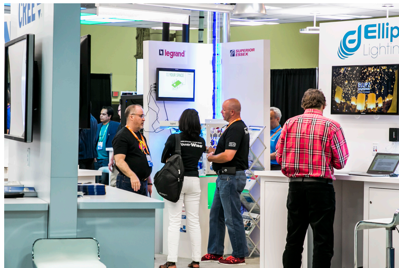
Cisco Live 2016 July 2016