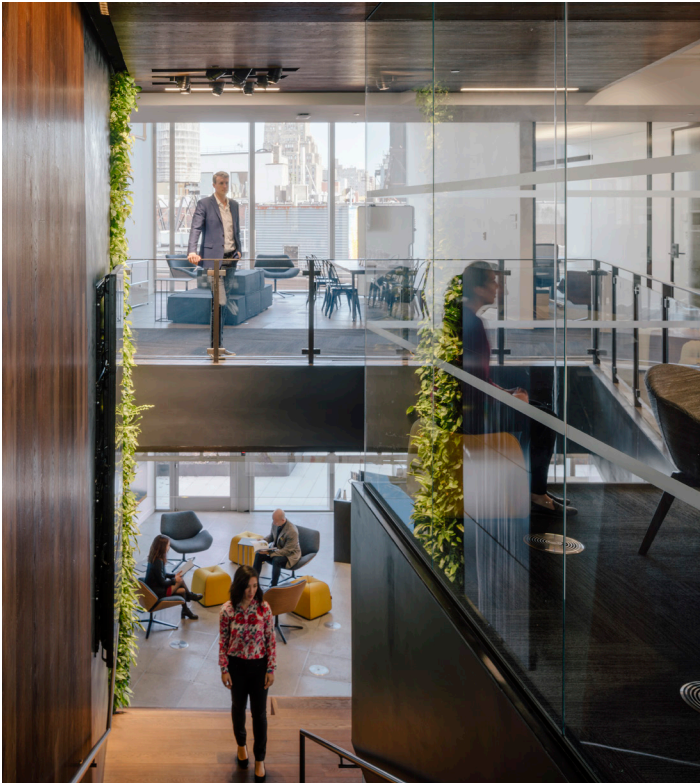
The open staircase at Delos encourages employees to move throughout the day.