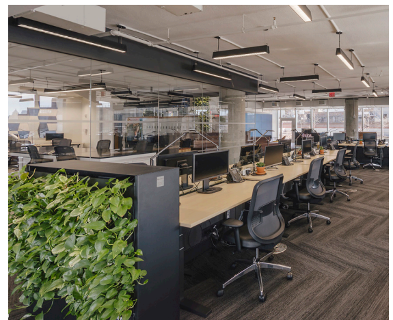
The open-floor plan promotes collaboration and plant walls help beautify as well as clean the air.

Delos decided to prove the environmental and health benefits of their space by seeking and achieving LEED Platinum, WELL Platinum and Living Building Challenge Materials Petal certifications. And Superior Essex sustainable cabling solutions helped contribute to all three of these green building standards bring Delos's plans to fruition.